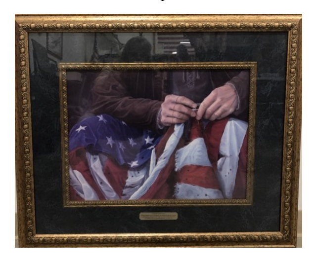
Plate Inscription at bottom

If my people, which are called by my name, shall humble themselves, and pray, and seek my face, and turn from their wicked ways; then I will hear from heaven, and will forgive their sins, and will heal their land.