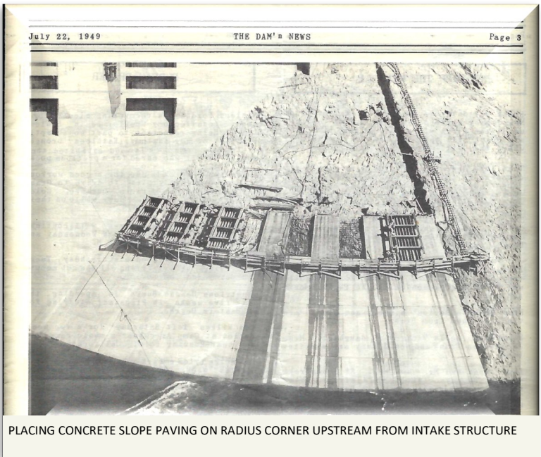
PLACING CONCRETE SLOPE PAVING ON RADIUS CORNER UPSTREAM FROM INTAKE STRUCTURE